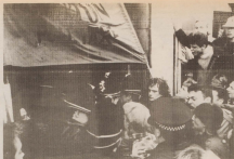
• "Blags me first!" Paying the Poll Tax with the smelly anarchists.