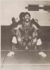
... and by golly it does you good.