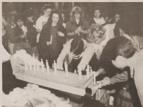
• One year on... Students remember the victims of the Tiananmen Square massacre on June 4th 1989.