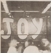
• JOY began life at The Warehouse and then moved on to the Poly to become the North's top dance spot.