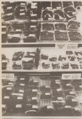
• British Beef: looks good, tastes good ...