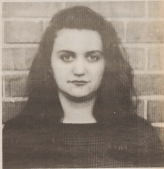
• A stormy and often bitter year came to an abrupt halt for LUX General Secretary, when she was kicked out of office by an OGM in the middle of the third term.