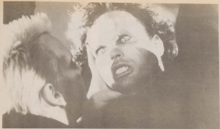
• "Sing reel sing reel" On the cop at the Thursday Bop.