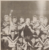
• "The sun shines out of our behinds . . ." The Poly Rugby League team could do no wrong winning the SRL Cup, the BPSA Cup, The Merit League and The Premiership Trophy.