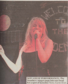
NOT A DUFFY PERFORMANCE: The Northern singer pops into our local for a spot of karaoke!

By dropping into the Brudenell Club this week to perform her other one single "Mercy" along to the rest of her upcoming